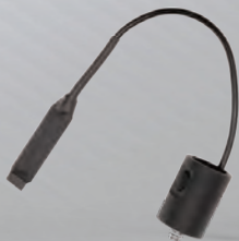
Remote Pressure Switch