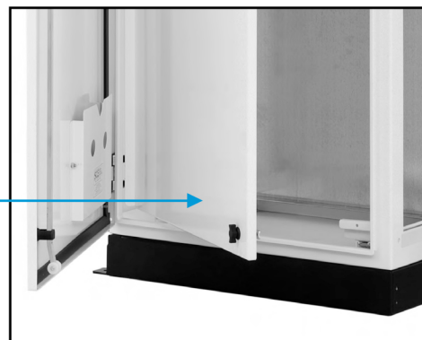
Dead Front/Swing Panel