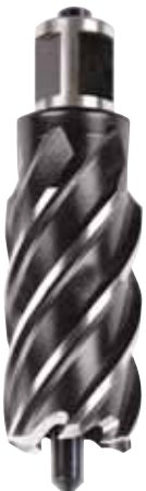
EJECTOR PIN SOLD SEPARATELY

25 sizes available. From 1/2" to 2" diameter hole sizes, 2" depth.