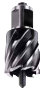
EJECTOR PIN SOLD SEPARATELY

25 sizes available. From 1/2" to 2" diameter hole sizes, 1" depth.