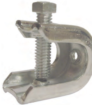
Conduit Beam Clamps