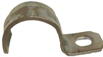
One Hole Straps