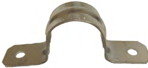
Two Hole Straps