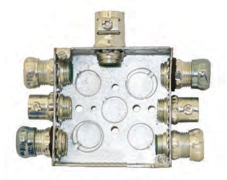
Wiring room using conventional steel connectors