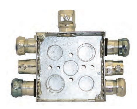
Wiring room using Space Saver Steel connectors