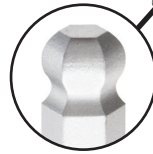
Ball End Tips