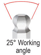
25° Working angle