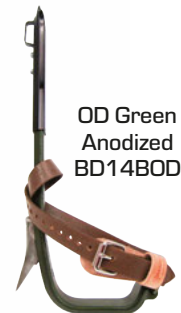
OD Green Anodized BD14BOD