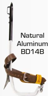
Natural Aluminum BD14B