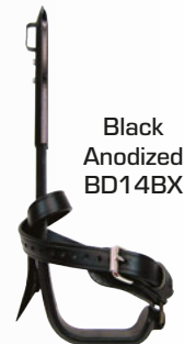
Black Anodized BD14BX