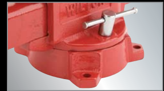
4 MOUNTING POSTS