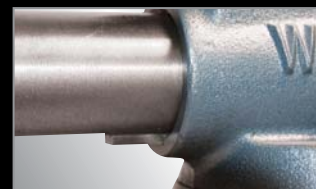
PRECISION SLIDE BAR