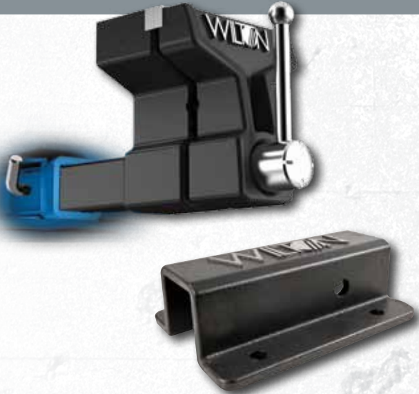
ATV WITH MOUNTING BRACKET