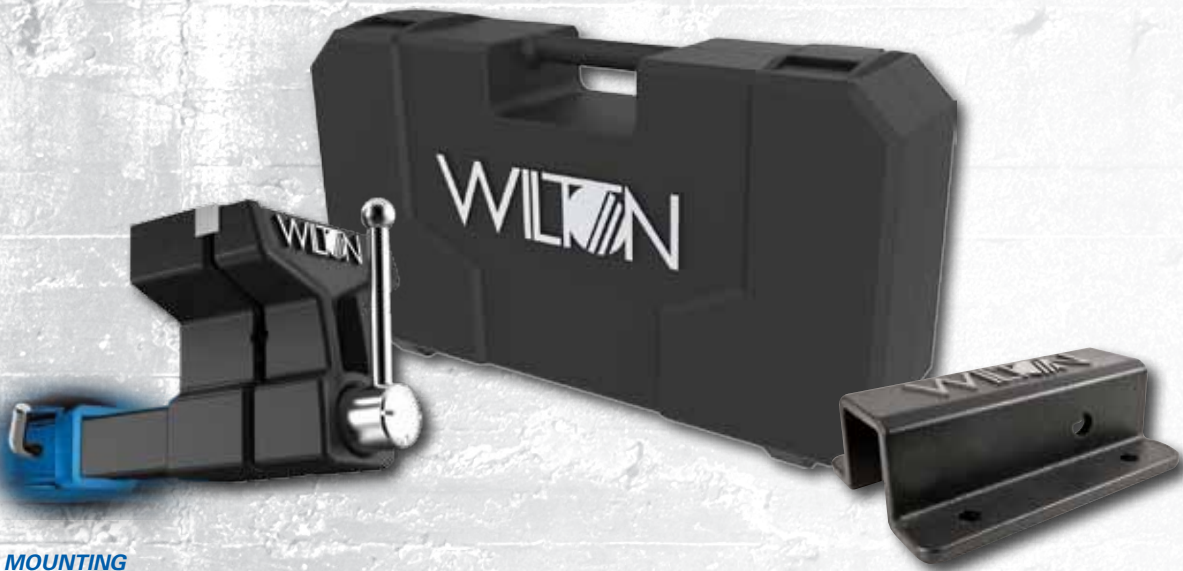
ATV WITH MOUNTING BRACKET AND CARRYING CASE

SECURE IT IN YOUR HITCH OR MOUNT IT ON YOUR BENCH