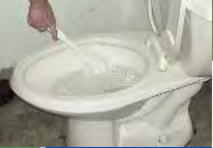
Cleaning a toilet with a Weiler Bowl Brush.