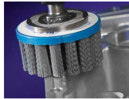
Deburring the edges of an aluminum engine cover.