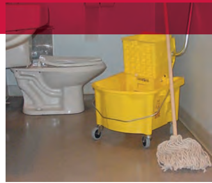
Use the Combo Bucket with 12 to 32 oz. mop heads

Our wet mops are made with industrial grade cotton and can be laundered. They will not scratch floors or unravel.