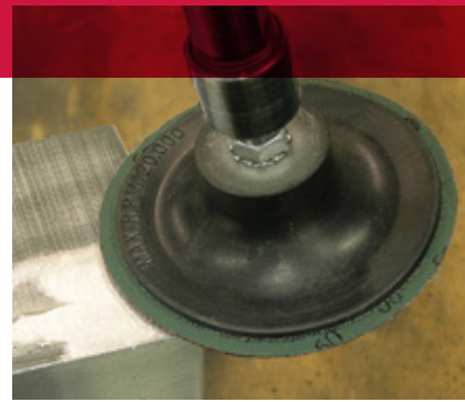
Blending welds and saw marks on a mounting bracket.