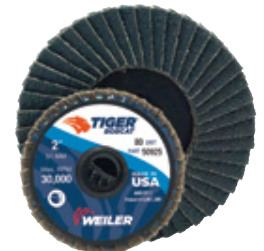
50924 & 50904