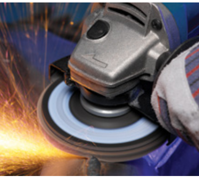
Blending and finishing a weld.