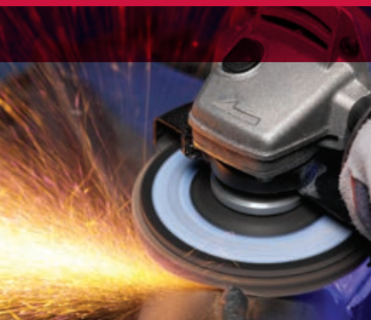
Blending and finishing a weld with a Big Cat flap disc.

High density flap discs last up to 40% longer than standard density. They are ideal for grinding and blending uneven or irregular surfaces.