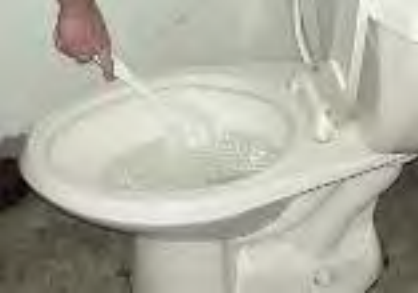
Cleaning a toilet with a Weiler Bowl Brush.