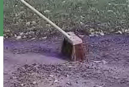
Sweeping debris in a parking lot.

Weiler now has a line of environmentally-friendly maintenance products. See pages 135-136 for details.