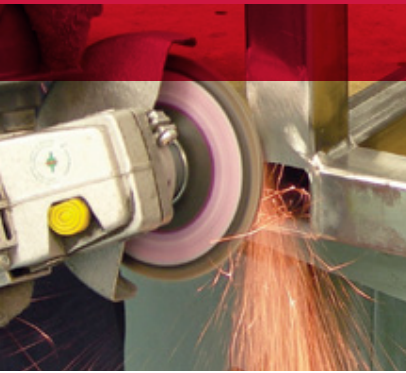
Grinding welds on a fabricated Steel part.