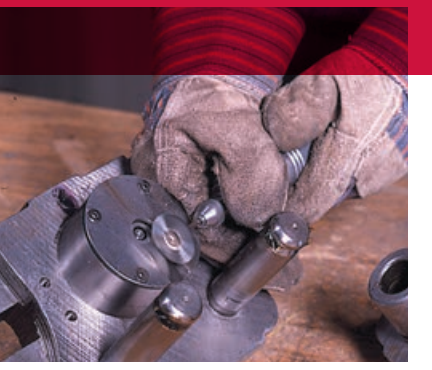
Removing galled spots from a metal forming die.

THE WEILER FAMILY began producing miniature brushes for the jewelry industry in 1898, and their tradition of providing the highest quality, most cost-effective products continues to this day.