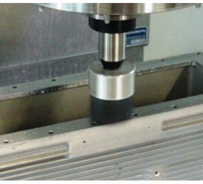
Deburring the machined face of an aluminum component.