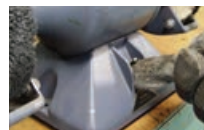
1. Turn off machine.

Prevents Smearing. Improves the Finish. Lowers Costs.