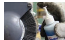
3. While rotating, direct a light spray of Lubricit into the wheel face.

Use with Nylox® wheels operating above the recommended surface speed. Directing a light spray of Lubricit into the face of the wheel permits the wheel to be operated at higher surface speeds and up to twice the normal load without smearing - while improving the finish.