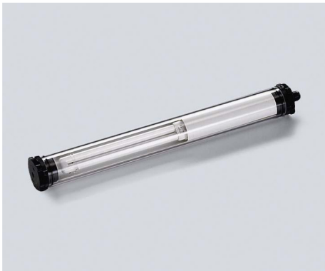
RL70CE - 124