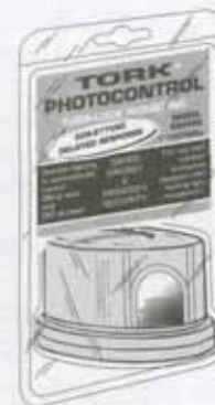
Models 5001SC, 5004SC, 5007SC