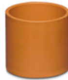
Socket type for joining non-metallic conduit.