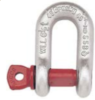
G-210 / S-210

G-210 Screw pin chain shackles meet the performance requirements of Federal Specification RR-C-271F, Type IVB, Grade A, Class 2, except for those provisions required of the contractor. For additional information, see page 444.