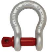
G-209 / S-209

G-209 Screw pin anchor shackles meet the performance requirements of Federal Specification RR-C-271F Type IVA, Grade A, Class 2, except for those provisions required of the contractor. For additional information, see page 444.