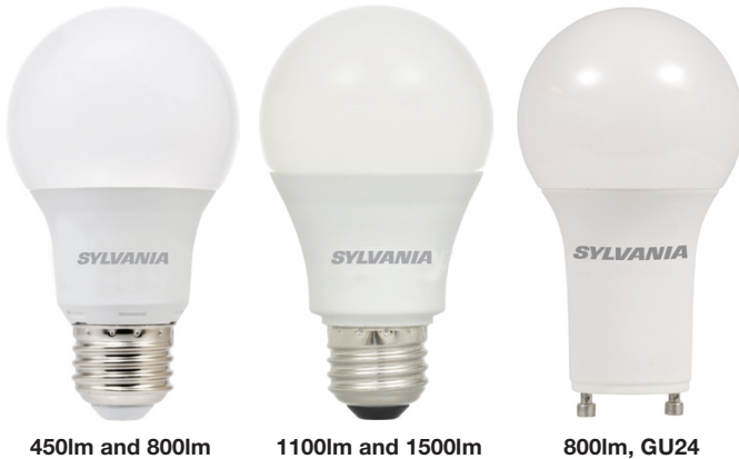
450lm and 800lm