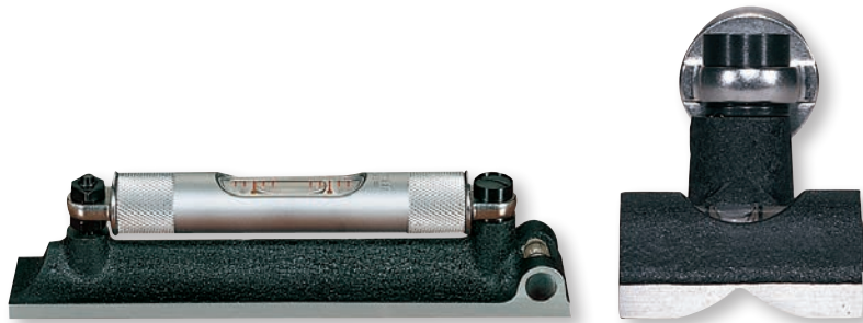
End view showing involute groove

The 6" through 18" (150-450mm) main level vials have graduations that are approximately 80-90 seconds or .005" per foot (0.42mm per meter). There are five, six, or seven lines on each side of the bubble, depending on the base length.