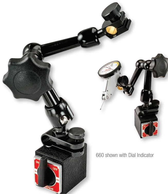
660 shown with Dial Indicator