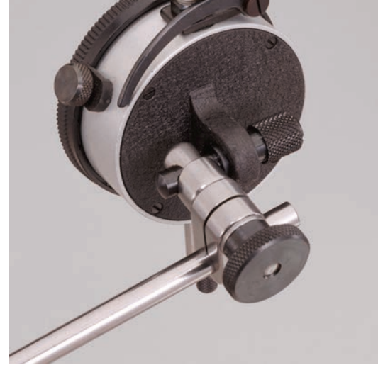
657Y with lug-on-center back