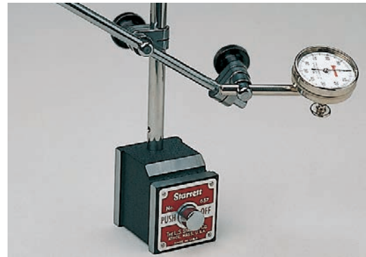
657AA with 196B1 Universal Dial Indicator