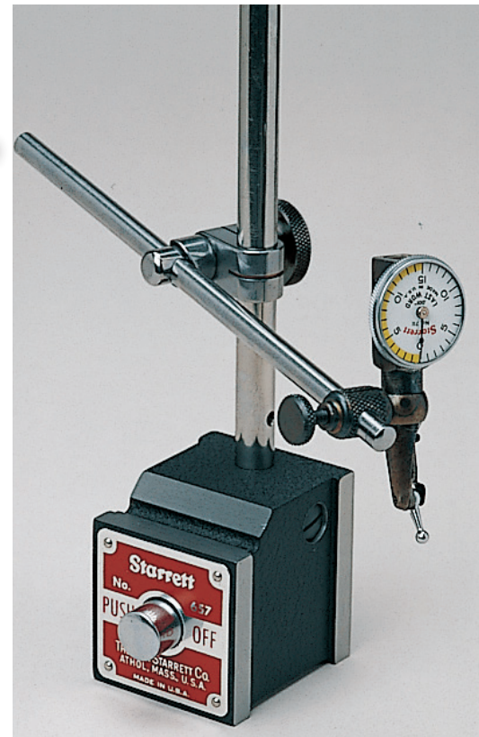
657AA with 711FS Last Word® Dial Test Indicator