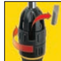
Patented Bit Storage