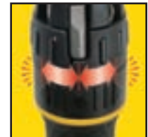
Three-way Audible Ratchet