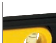
Pipe groove for use on rounded surfaces