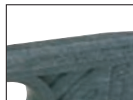
Pipe groove for use on rounded surfaces