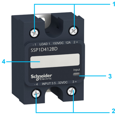
SSP1 single-phase panel mount relays