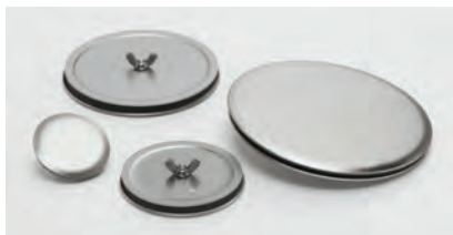
Stainless Steel - U.L. listed as Type 4X