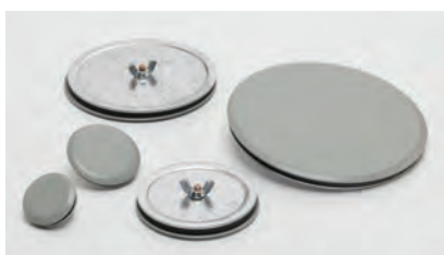
Painted Steel - U.L. listed as Type 3R, 12, 13, & 4