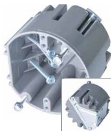
SBFAN Fan box

An adjustable depth, new work, old work ceiling box. Extra deep for mounting all smoke and carbon detectors. 50 lbs. Fixture Support.