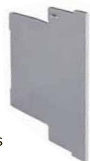
SBMMW Wall Divider

Low Voltage / Line Voltage Barrier. Wall Dividers fit all (2) - (6) gang MM Boxes (in multiple locations).