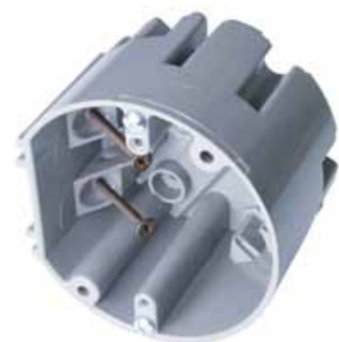
SBRND Round Box

An adjustable depth, new work, old work ceiling box. Extra deep for mounting all smoke and carbon detectors. 50 lbs. Fixture Support.