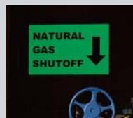
Low Light Applications