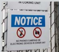
Custom Signs On Demand