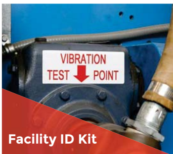
Facility ID Kit