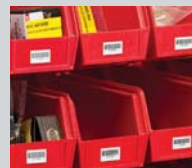
General ID ...and many more!