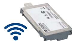
WiFi Only Card Required if printing from Mobile Apps (Catalog#: NET-WIFI)