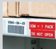
Facility & Safety Identification