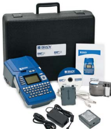
(Catalog #BMP51 shown)

Patents applied for: 6,732,619 and 7,070,347 on printer. 6,929,415 on the PermaSleeve® cartridges. 8,542,155 on wireless and ethernet cards.