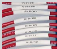
PermaSleeve® Wire Marking Sleeves