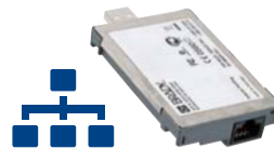
Ethernet Only Card (Catalog#: NET-LAN)