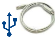
Included USB Cable

The BMP®51 printer connects to your PC via the included USB cable. To avoid use of a physical cable, optional field-installable network cards are also available: