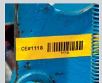
Indoor / Outdoor Vinyl Labels...and more!