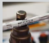
PermaSleeve® Wire Marking