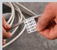
Voice & Data Communications