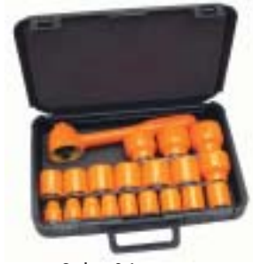
Sockets & Accessories