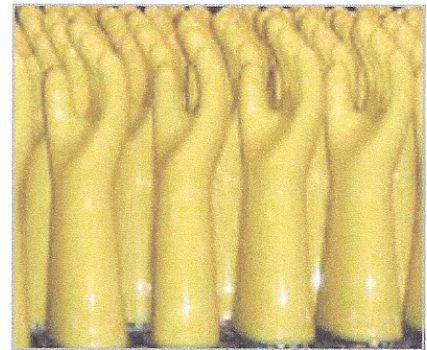
E011Y Gloves being manufactured.