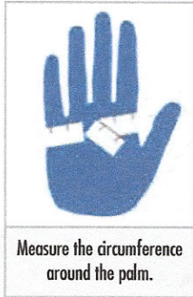
Measure the circumference around the palm.