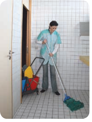
R001531 with R001530 and FGT81206GR00 Web Foot Tube mop (page 68).