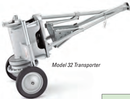
Model 32 Transporter