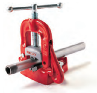
Bench Yoke Vise