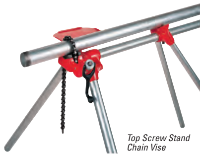
Top Screw Stand Chain Vise

*Jaw for Plastic Pipe, Catalog No. 41280 available; order separately