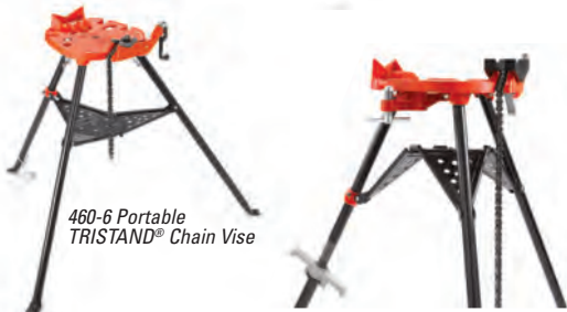
460-6 Portable TRISTAND® Chain Vise