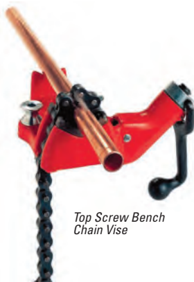
Top Screw Bench Chain Vise