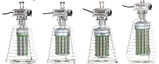
111060LED 111080LED 1110100LED 1110150LED