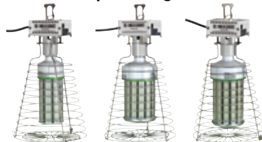
111060NR 111080NR 1110100NR