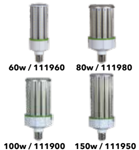
100w / 111900 150w / 111950