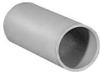
Sch 40 Longline Coupling No Center Stop (Repair Coupling) (Fabricated)