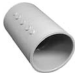
Sch 40 Longline Coupling with Center Stop (Molded)