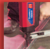
Steel Track to Concrete