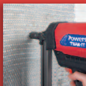
Lath to Concrete, Block, Brick & Steel